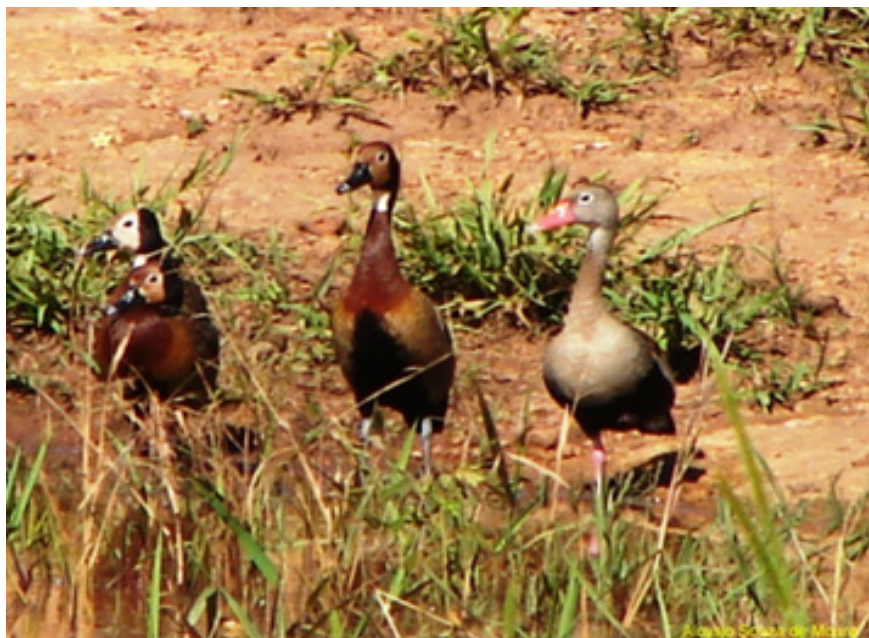
Figure 2. Mixed flocks composed by Dendrocygna viduata (left), Dendrocygna bicolor (center) and Dendrocygna autumnalis (right), Jequitaiá city, north of Minas Gerais State, Southeastern Brazil.