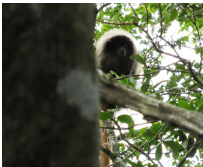
Figure 2. Callicebus nigrifrons , monkey-sauá foraging fruits of G. brasiliensis , region of Cruzeiro do Vale do Canta Galo, São Thomé das Letras, south of Minas Gerais, southeastern Brazil.

On March 16, 2015, around 1:25 pm, five ‘Sauás’ ( C. nigrifrons ) were visualized and later photographed (Figure 2), consuming fruits of G. brasiliensis on the edge of a fragment of seasonal forest semideciduous high montana (44°56'06.13''W/21°43'06.51''S, 1246m). The group remained in the tree for approximately 27 minutes, during which time they manipulated the G. brasiliensis fruits, opening them and throwing the leftovers around in an almost human act. Possibly the leftovers and seeds released by C. nigrifrons contribute to the G. brasiliensis dispersal, however they have dispersed them near the mother plant, they may be contributing with secondary dispersers, benefiting actions by terrestrial birds, Mimercocoria, and even Saurocoria.