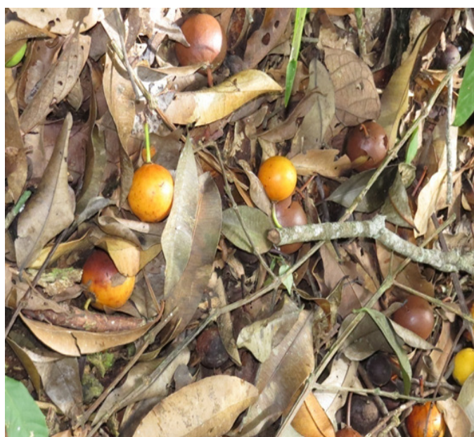
Figure 3. Fruits of G. brasiliensis fallen to the ground after group visit of C. nigrifrons tree, region of Cruzeiro do Canta Galo, São Thomé das Letras, south of Minas Gerais, southeastern Brazil.

After the stay and foraging of fruits in the G. brasiliensis plant, many mature fruits fell on the soil (Figure 3), indicating possible contribution with dispersion by Hydrocoria, if we take into account the location (top of saw), its slope ( > 45^\circ ) and its proximity of the plant to a watercourse. This course is approximately 3 m from this plant and acts as a drainage channel for rainwater from this mountain range during rainy periods, ending in the lower reaches of the Canta Galo valley, becoming a tributary of the popularly known “Moon waterfall”.