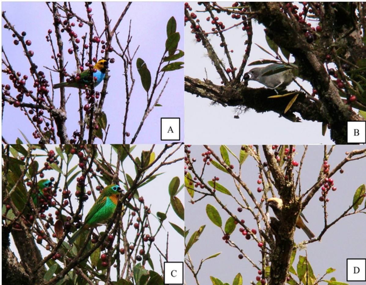
Figure 2 Species of Tangara consuming fruits of Siphoneugena widgreniana registered at Chapada dos Perdizes, between the municipalities of Carrancas and Minduri in the state of Minas Gerais, southeastern Brazil: A– T. cyanoventris ; B– T. sayaca ; C– T. desmaresti ; D– T. cayana . (Photos by Aloysio Souza de Moura).

T. sayaca (LINNAEUS, 1766) (Figure 2B), T. cayana (LINNAEUS, 1766) (Figure 2C) and T. desmaresti (VIEILLOT, 1819) (Figure 2D).